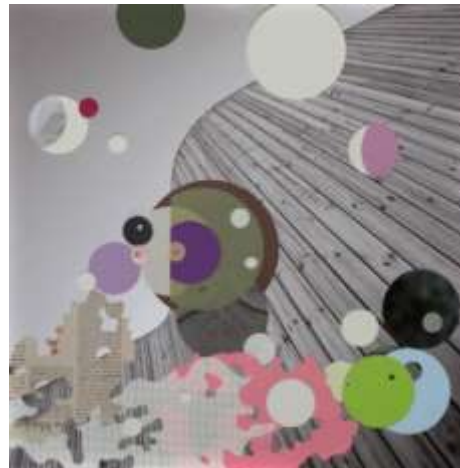
Andrés Ferrandis, Transparente , 2014 Collage on printed image 18 x 18"