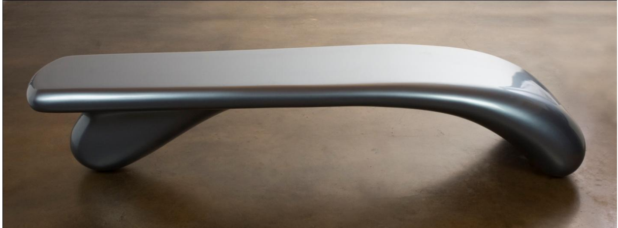
George Schroeder, Carrera Table , Fiberglass, 74" x 19" x 19"

George Schroeder's large-scale sculptures have been commissioned as public art in San Antonio and internationally. His artwork—both sculpture and furniture—are known for physicality, rawness and remarkable elegance. The artist's interest is to create abstract sculptures that evoke tension within form; for the sculptures to ultimately to change the space into a definitive visual experience. His furniture brings the same sensibility to functionally elegant pieces for the home or work space.