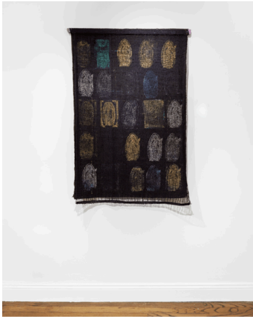
Consuelo Jimenez Underwood, Night Lights , 1991, Woven panel and veil, silkscreened, textile paint, silk, cotton, and synthetic threads, 53 x 36.5 in., 134.6 x 92.7 cm