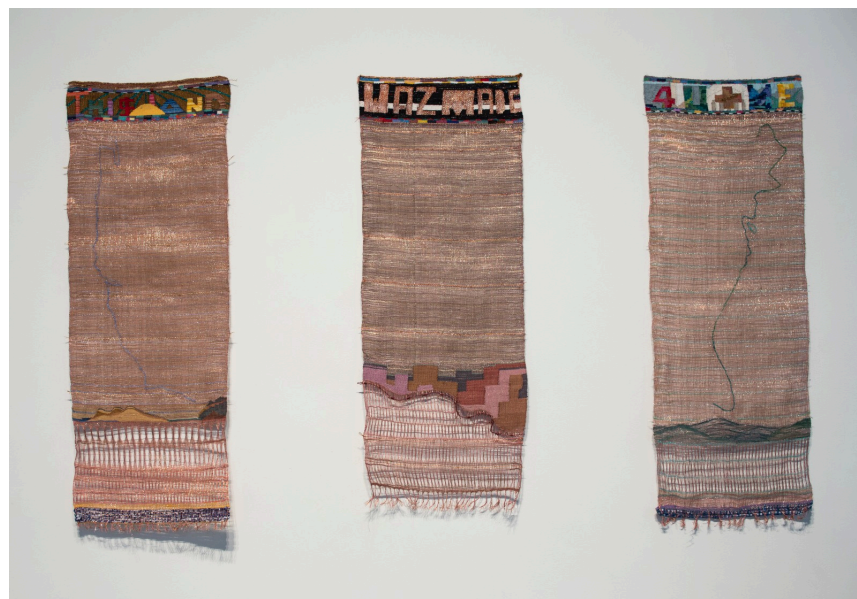
Consuelo Jimenez Underwood, Woody, My Dad and Me , 2018, Woven wire, linen, metallic, and cotton thread 49 x 17 each (49 x 51 in) 124.5 x 43.2 cm