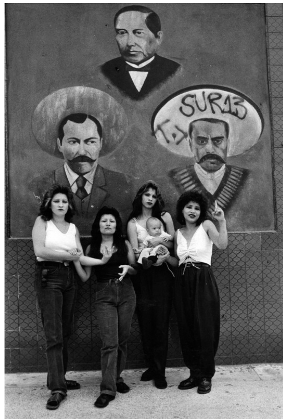
Graciela Iturbide, Cholas I (con Zapata y Villa) White Fence, East L.A. , 1986, Signed by the artist in ink on recto, Silver Gelatin Print 20 x 16 in., 50.8 x 40.6 cm