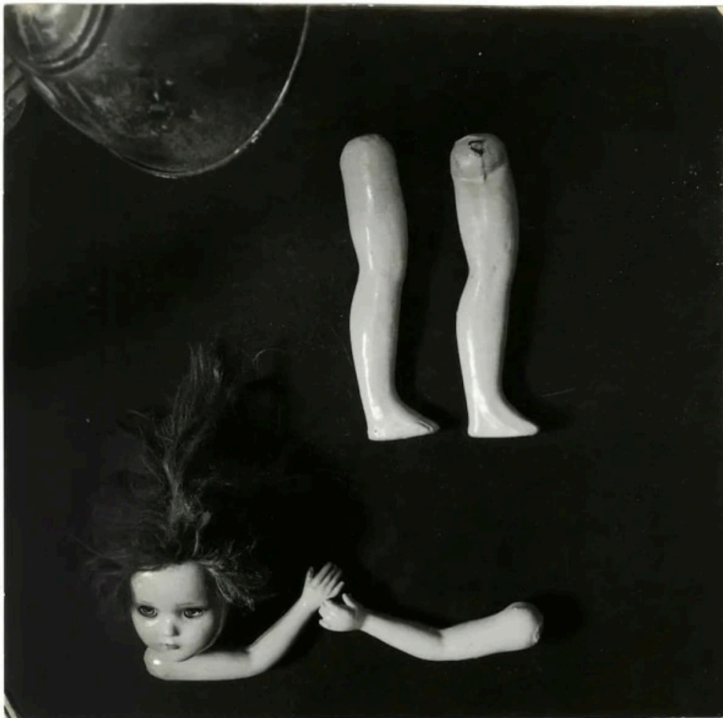
Kati Horna, Untitled, Mexico , 1949/1960, Signed on verso in pencil, gelatin silver print (Photomontage), 8.10 8 in., 20.6 x 20.3 cm.