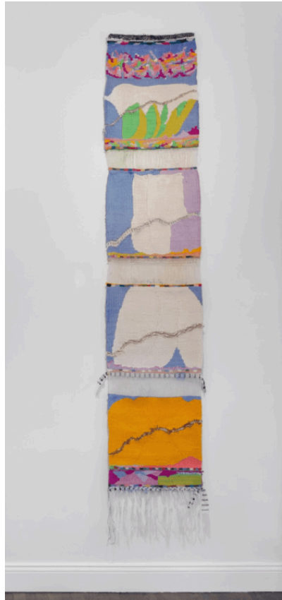
Consuelo Jimenez Underwood, Four Xewam , 2013, Signed, titled and dated on the reverse, Tapestry and exposed warp, silk, linen and cotton threads, leather barbed wire, cotton fabric, 96 x 18.5 in, 243.8 x 47 cm