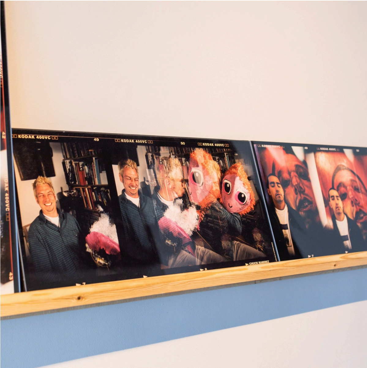
Acquisition of a prominent selection of Celia Álvarez Muñoz's Semejantes Personajes/Significant Personages series, 2002, Digital Holgas, 14 x 30 in., each photograph, 35.6 x 76.2 cm