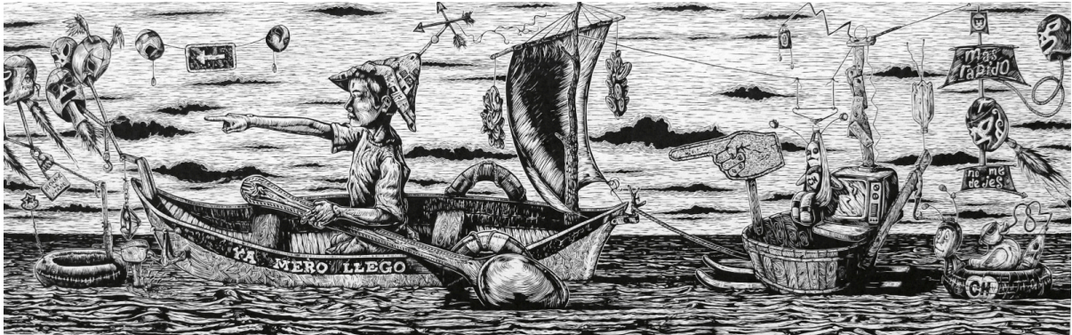
Juan de Dios Mora, Ya Mero Llego (Almost There) , 2019, Linocut, 15 x 41.3 in., 38.1 x 104.9 cm, Edition of 5