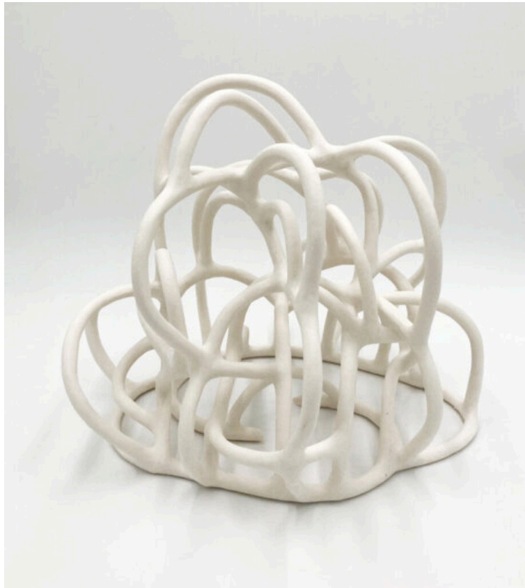
A work included in "Christy Wittmer: brittle as bone"