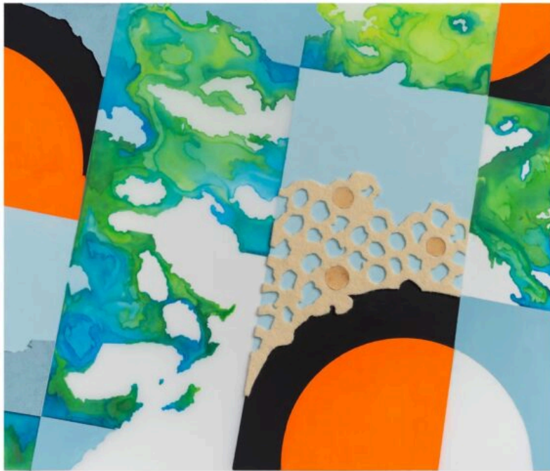
Constance Lowe, "Drift Threshold #5, (Tapioca Tundra)," 2023, acrylic paint and ink, wool felt, and leather on drafting film, 19.5 x 23 inches

Glasstire counts down the top five art events in Texas.