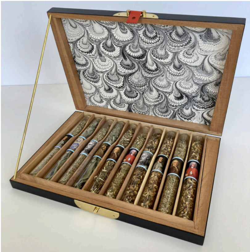
Cynthia Mulcahy, "Daddy (War Garden Series)," 2024. Tansy, pennyroyal, angelica, sage, glass tubes, wood, enamel lacquer, Peacock-pattern hand-marbled paper, dyed calfskin, archival glue, brass rod, leather glue, brass hinges. 9 x 11.5 x 8.25 inches (box lid open).