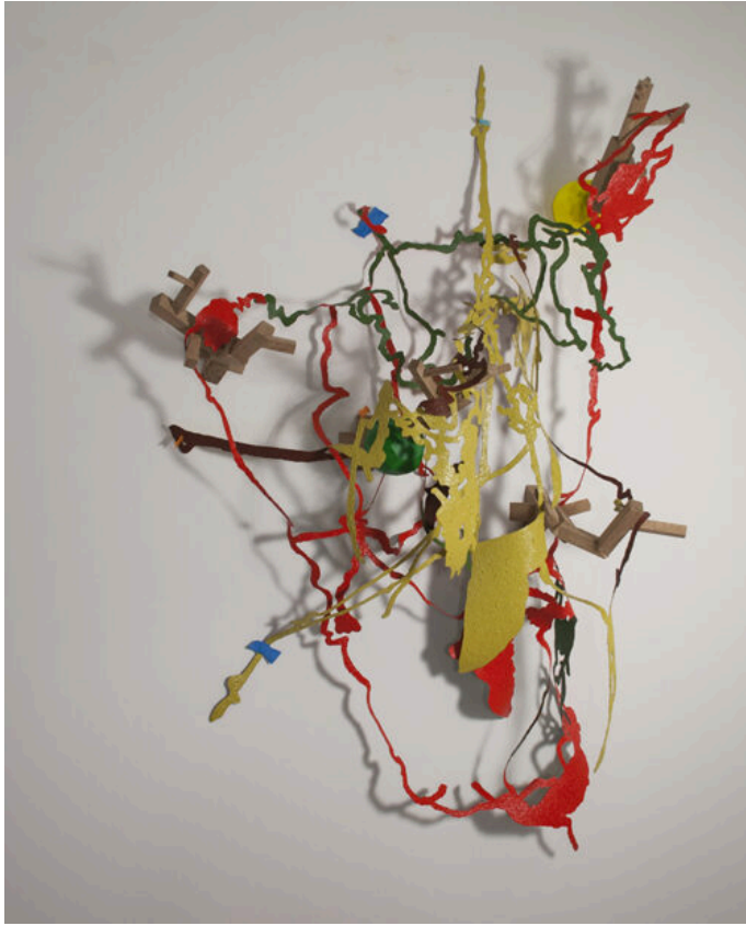
Leigh Anne Lester, "The Eternal Series of Destruction and Resurrection," 2024, wood, drafting film, acrylic paint, shadow, map flags