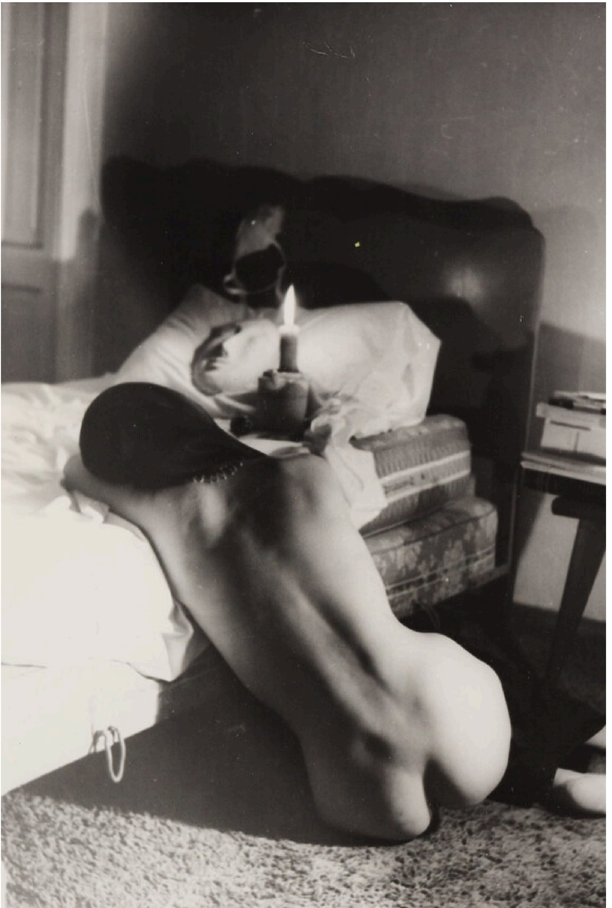
1. Liliana Porter, China/Niña , 2010.